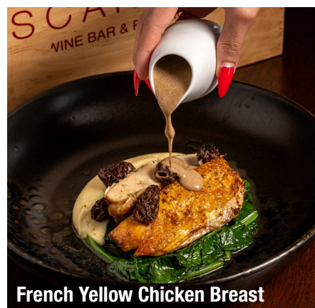
French Yellow Chicken Breast