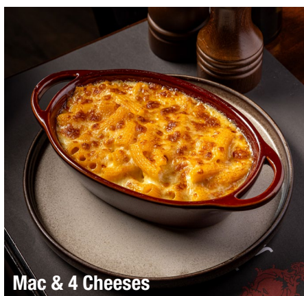
Mac & 4 Cheeses